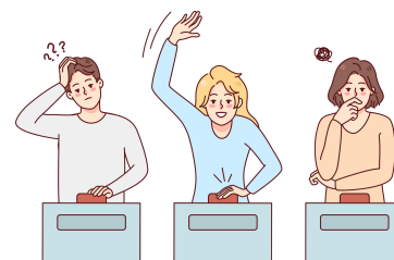
Price is Right Mar 18th @ 10:30AM