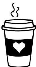
Coffee Chat Mar 21st @ 10:00AM