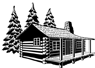
Lodge Meeting Mar 13th @ 10:30AM