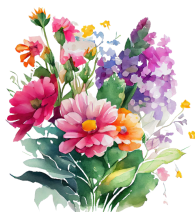
Paper Flower Bouquet Mar 5th @ 2PM