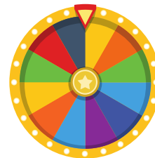
Wheel of Fortune Mar 11th @ 10:30AM